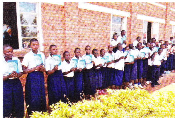
Students with New Books!

Your many donations made it possible to fund the purchase of books for all the students.