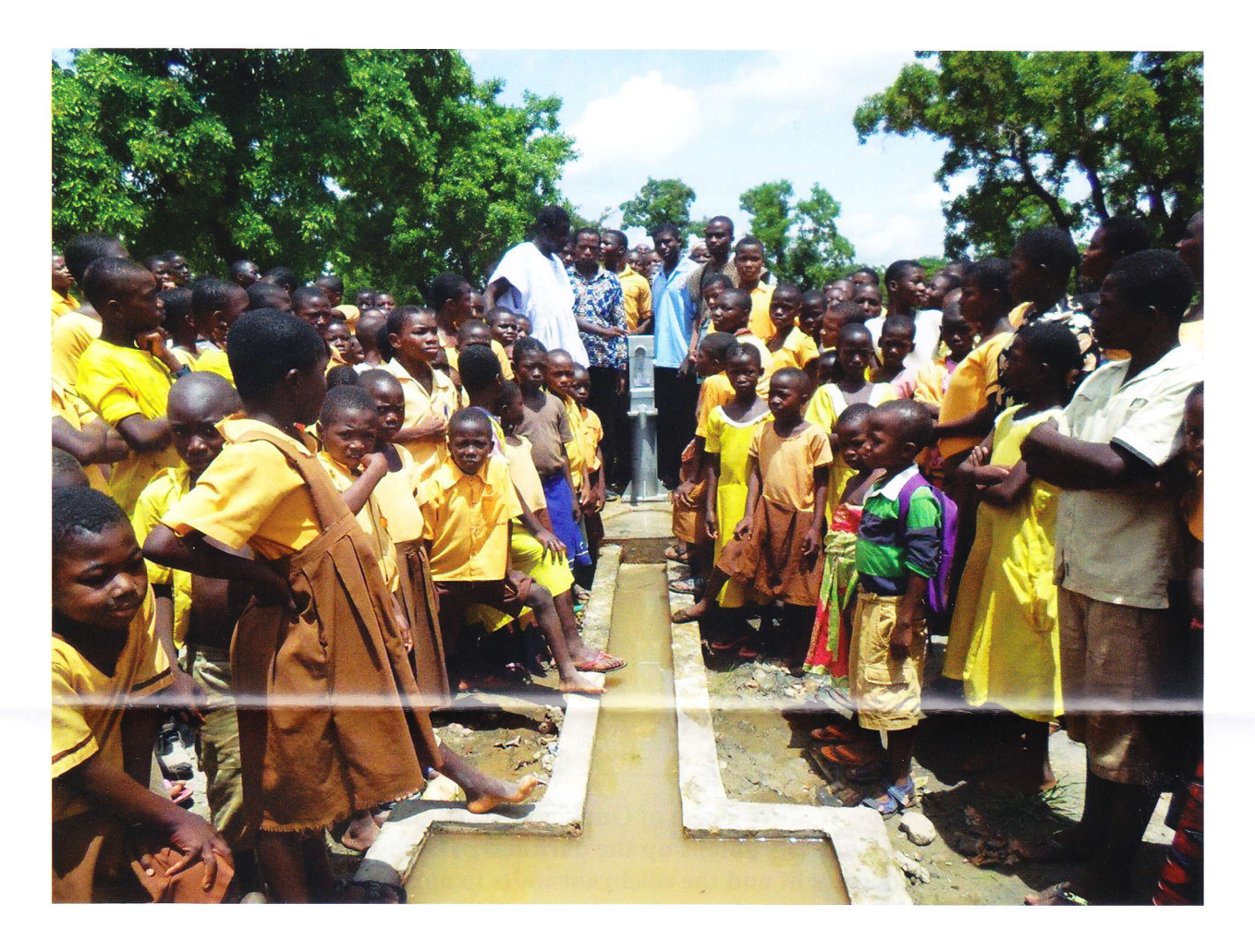
Education is the Key to Development and Empowerment

The construction and installation of a borehole well is very detailed and includes preparation of the well site, drilling through fresh rock, prepping the borehole with cement and gravel, testing the pump and finally installation of the pump. Of course, many labor hours make this possible. At St. Dominic's and St. Michael's Primary and Junior High Schools located in the small villages of Naville and Kulpienni, WA, Ghana not one borehole well but two were installed for the students and people of each village.