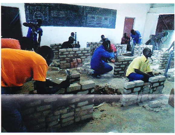
Vocation Training for a Better Life!

The Bupe Mulenga Youth Training Centre in Ndola Zambia is a special and unique place. The centre only accepts students from poor backgrounds and does not demand any specific academic qualifications. In fact, the only requirement is a desire to learn new skills and become a productive member in their community.