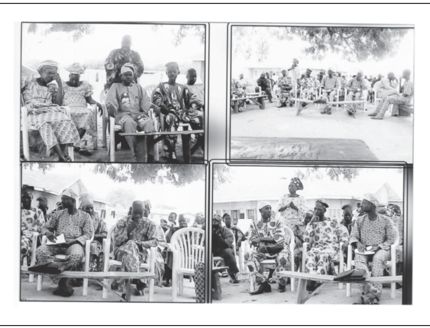
Donate online WWW.Missionariesofafrica.org

We all know that the many forms of communication are rapidly being developed and also the easy way to reach out to people. Yet, not everyone has access to the latest communication techniques, such as email, Facebook, Twitter and Instagram. The Diocese of Kasongo's Office of Social Communication uses the "traditional" communication methods to proclaim their message and engage the youth in living their Catholic faith. There are fifteen parishes evangelized through the diocesan's quarterly newsletters, the semi-weekly local radio messages and creating DVD's from their conferences. These communication activities are successful because it extends to over one million people of the diocese. Keeping up with this communication demands new equipment...computers, digital cameras, and recorders, photocopying machine, printers, paper and ink. By our current standards, they are not on the cutting edge of communication but the people of the Kasongo Diocese call it mass media!