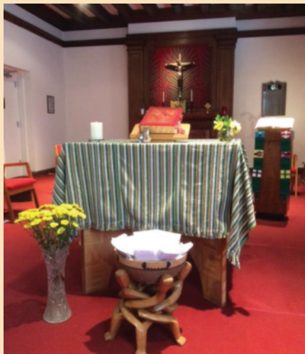
Photos: The calabash (African bowl) holding prayer requests from the benefactors in the chapel of the Missionaries of Africa, Washington, DC.

“For a closer walk with Jesus... among the People of Africa.”