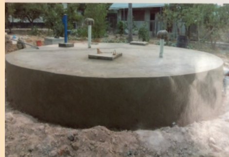
Project completed in Tabora