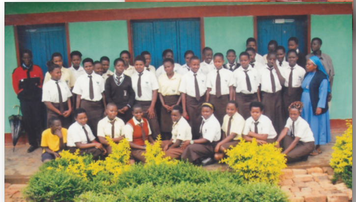
ABOVE PHOTOS: (TOP) WORKER INSTALLING SOLAR PANELS; (BOTTOM) SOME OF THE STUDENTS AT ST. ANNET