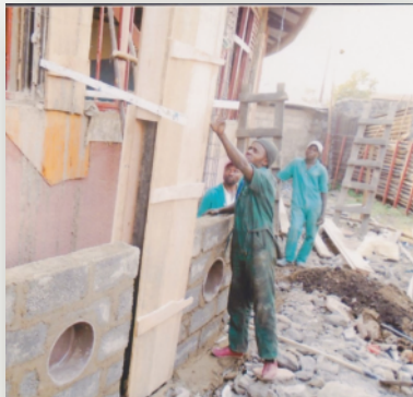
Above: Work in progress on the Youth Center; Bottom: Worker mixing cement