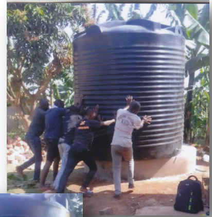
Top: Workers placing a water storage tank on its foundation.