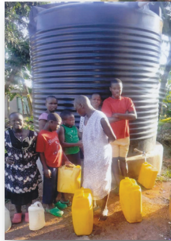
Left photo: Community residents standing in line to fill their containers with clean water!

Top photos courtesy of Fr. Godwine Bwambale. Bottom photo courtesy of Fr. Emmanuel Obidiah.