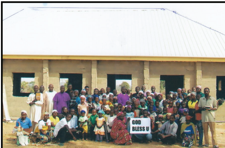
St. James' parishioners in front of their completed church!

Because of the continued caring of friends like you, the parishioners of St. James Pastoral Area have finally gotten a new roof for the church.