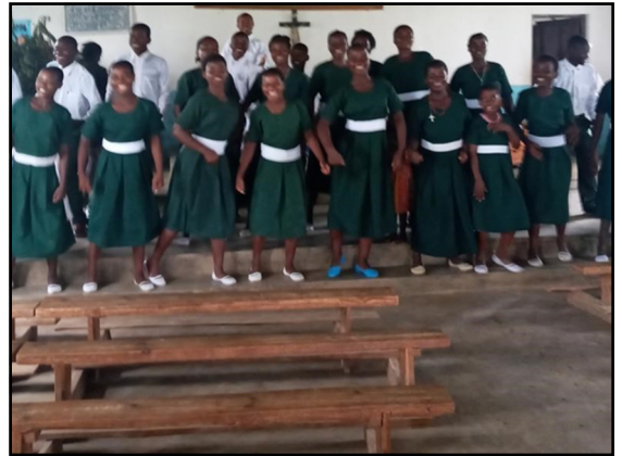
TOP RIGHT: WORKERS COMPLETING MASONRY WORK. BOTTOM RIGHT: CHOIR FESTIVAL HELD IN THE NEW HALL. LEFT: THE NEW HALL