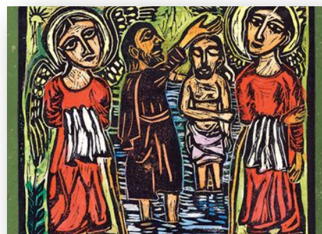
Batik of "The Baptism of the Lord"

Throughout the African continent, celebrating Easter is the highpoint in the life of Christian communities. In most parish churches, the Easter Vigil is highly anticipated. Churches are often decorated with vitenge and kanga cloth, illustrating new life in the form of butterflies, flowers, banana trees, etc. Hymns are sung accompanied by the beating of drums and vigelegele (shouts of joy), the high-pitched sounds made by women. After Mass, traditional dances are held outside of the church. People then return home to continue their celebrations with local food and drinks. "Since many adults are baptized during the Easter Vigil," explains Fr. Antonio Koffi, treasurer of the Missionaries of Africa in the U.S., "it is common for families to bring infants for Baptism on Easter Monday. I remember baptizing hundreds of children on Easter Monday when I was pastor at St. John the Baptist in Nabulagala, Uganda. You are busy all day, but it is a wonderful time for the whole community."