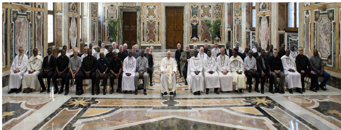
Left: Members of the Missionaries of Africa meeting with Pope Francis at the Vatican during the General Chapter this past May-June. Above: Pope Francis greeting one of the Missionaries.