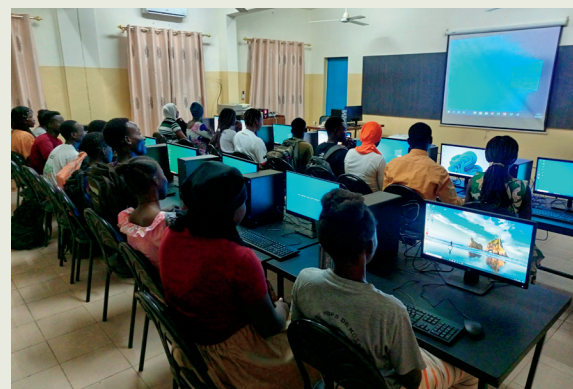
At the Centre d'Etudes, le Pelican in Ouagadougou, Burkina Faso, new floors and furniture elevate the computer room's transformation.

This renewal not only revitalizes the physical space but also reinforces The Pelican's commitment to fostering education, community, and safety for Ouagadougou's youth. The Missionaries of Africa extend heartfelt gratitude to the dedicated donor whose support significantly contributed to The Pelican's positive transformation.