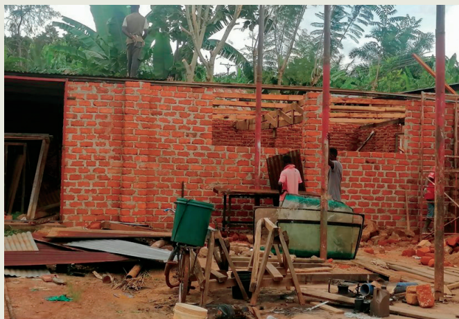
Converting a garage into a shop classroom at the continually improving Youth Center in Kasulu, Tanzania.

In 2012, the Missionaries of Africa in Kasulu, Tanzania embarked on a mission to revive a closed school, transforming it into a vital Youth Center that provides both social services and education. Initially, aid was provided to restore the school building and make it functional once again. However, the community didn't stop there. Over the past decade, with the generous support of donors in the United States and Germany, we have been able to expand the services at the Youth Center, reaching a growing number of young people.