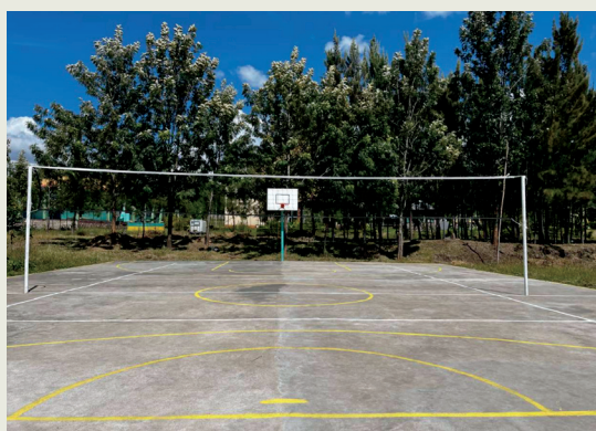
The freshly built basketball court signifies the transformative journey underway at the Selam Youth Centre.

The transformation of the Selam Youth Centre in Kombolcha stands as a testament to the resilience and unity of the community. This vital space, once marred by conflict, has been reborn, welcoming young minds from various backgrounds and beliefs to its rebuilt recreational facilities.