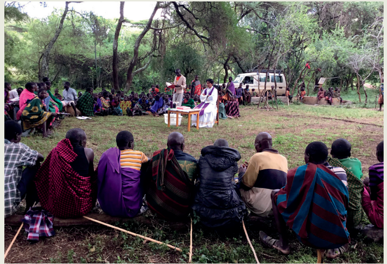
Outdoor Mass with the Pokot people in eastern Uganda.

As an important benefactor of the Missionaries of Africa, you are integral to this expanding ministry. Thank you for your support and partnership in our mission.