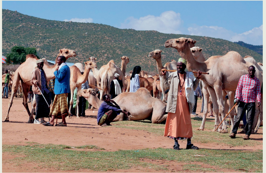
Traders buy and sell camels in the camel market in eastern Ethiopia.