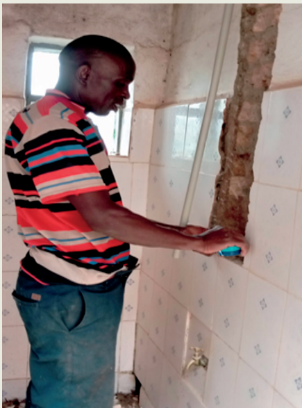
Installation of insulated hot water pipes at Rushoroza Mother House in Kabale, Uganda

Thanks to the support of U.S. donors to the Missionaries of Africa, senior sisters in central Uganda now have hot water. The sisters, who are part of the Daughters of Our Lady of Fatima and reside at Rushoroza Mother House in Kabale, are benefiting from having running hot water for bathing and cleaning for the first time. Assistance from the Missionaries of Africa helped to purchase and install solar water heaters, insulated hot water tanks, and new hot water pipes.